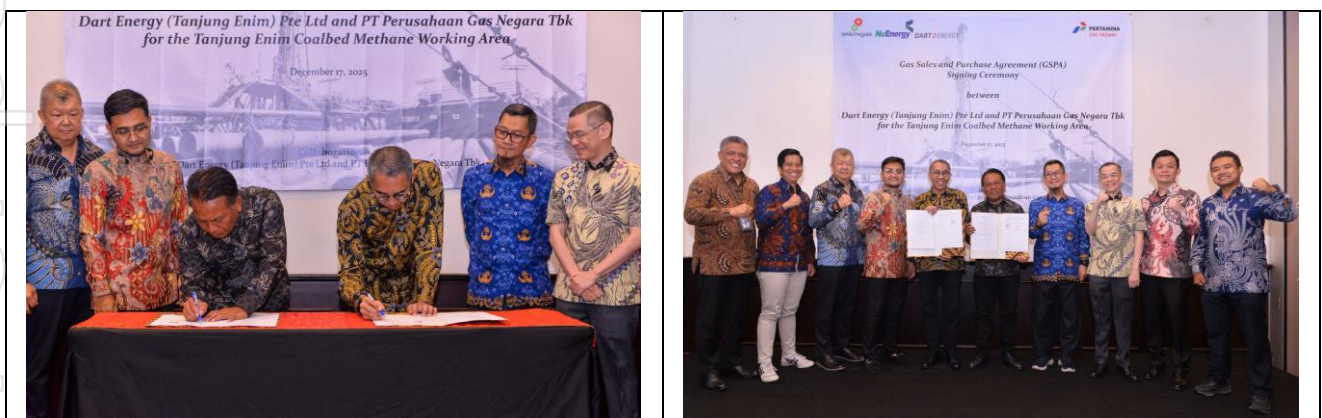
GSPA Signing Ceremony

Following the Heads of Agreement for the sale and purchase of CBM between NuEnergy (as the seller) and PT Perusahaan Gas Negara ("PGN") (as the buyer), a leading natural gas distributor in Indonesia and a subsidiary of PT Pertamina, the parties had on 17 December 2025, signed a binding Gas Sales and Purchase Agreement ("GSPA") for the sale and purchase of 1 MMSCFD CBM.