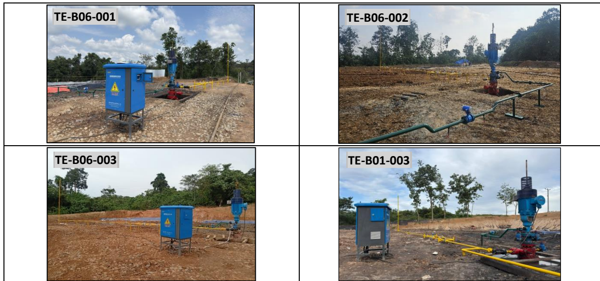
Dewatering and Gas Flaring activities at Tanjung Enim Early Gas Sale