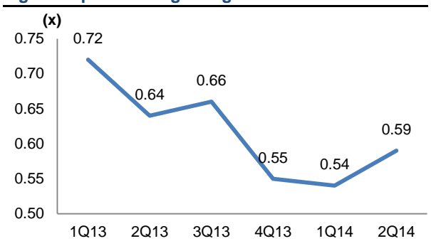
Fig 4: Tropicana net gearing ratio