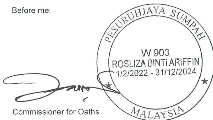
Commissioner for Oaths

10-8-2, Tingkat 8, Queens Avenue, Jalan Bayam, 55100 Kuala Lumpur. H/P: 018-3858677