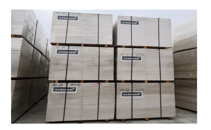
Exhibit 9: Finished Product