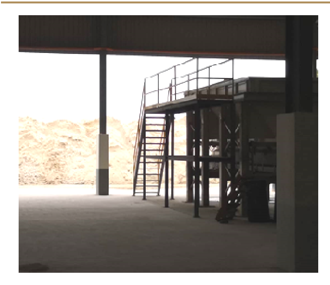
Exhibit 3: Mixing and Pouring of Raw Materials