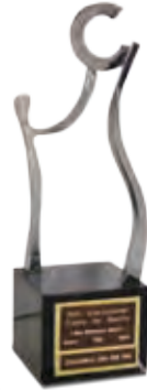
28 th International Trophy for Quality (New Millennium Award), Madrid 2000, Spain