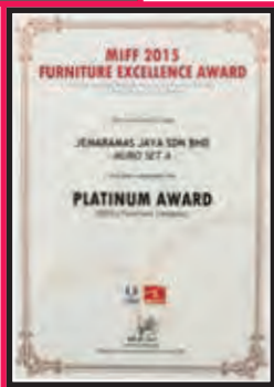
MIFF 2015 Furniture Excellence Platinum Award, Office Furniture Category