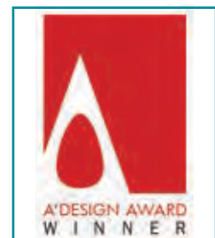
“Winner in Furniture, Decorative Items and Homeware Design Category, 2014-2015”