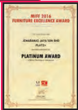
MIFF 2016 Furniture Excellence Platinum Award, Office Furniture Category