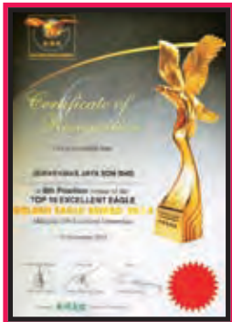
Golden Eagle Award 2014 Top 10 Excellent Eagle