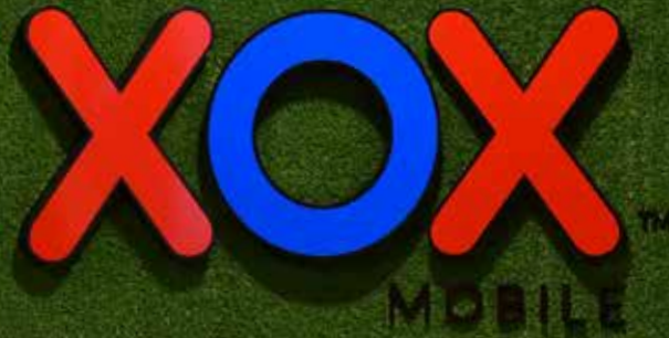
EDWIN CHIN VIN FOONG