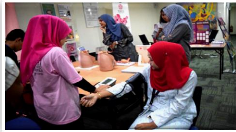
CANCER AWARENESS PROGRAMME