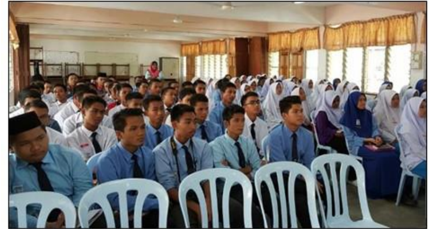
Selected SPM candidates of SMK Jeram at the recent launch of the English Language Tuition Programme 2.0 .

As a continuation from the 2015 initiative, UMW-OG extends its presence at its adopted school following the positive outcome of the previous edition and also feedback from the school itself.