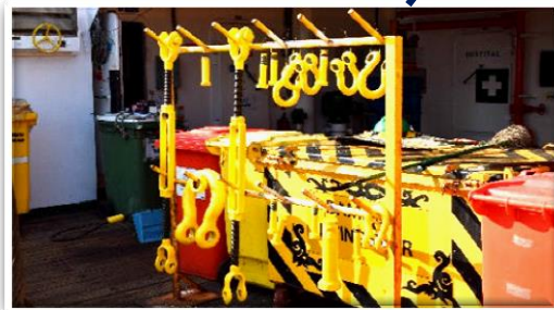
GAIT 3 BARGE INSPECTION