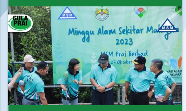
Environmental Week 2023

Celebrating the environment including mangrove planting at Prai