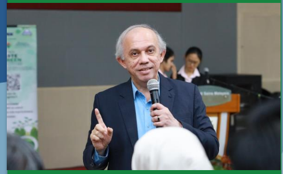
UKM ESG Talk

Collaboration with UKM for a talk introducing ESG