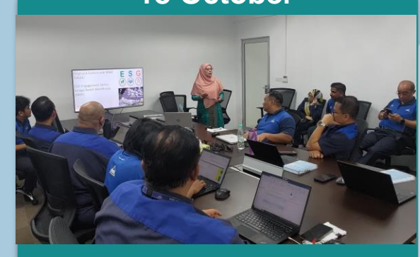
ESG Engagement with Site