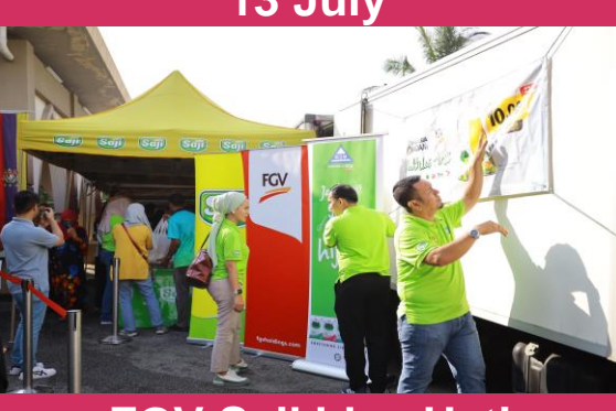
FGV Seikhlas Hati

MSM staff joined FGV in helping with the PPR Semarak Program