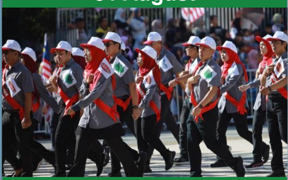
Merdeka Parade Day

MSM participated in the Merdeka Parade Day March