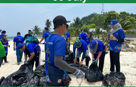
Pulau Aur Beach Cleaning

Collaboration with Jabatan Perikanan Negeri Johor and community of Pulau Aur