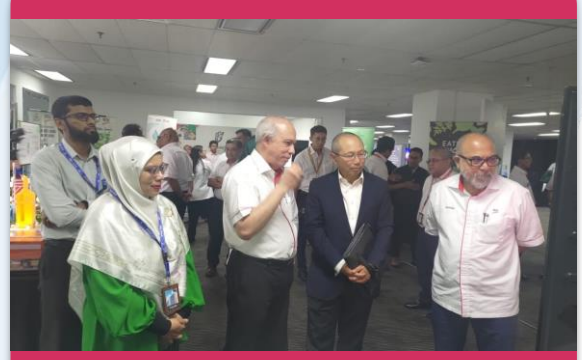
FGV Sustainability Week

Sharing session on MSM's carbon footprint and exhibition