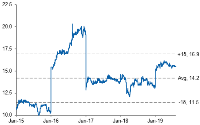
Exhibit 4: PE Band chart