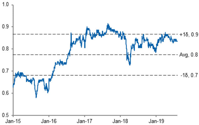
Exhibit 3: PB Band chart