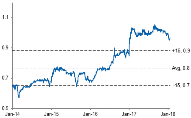
Exhibit 1: PB Band chart