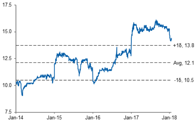
Exhibit 2: PE Band chart