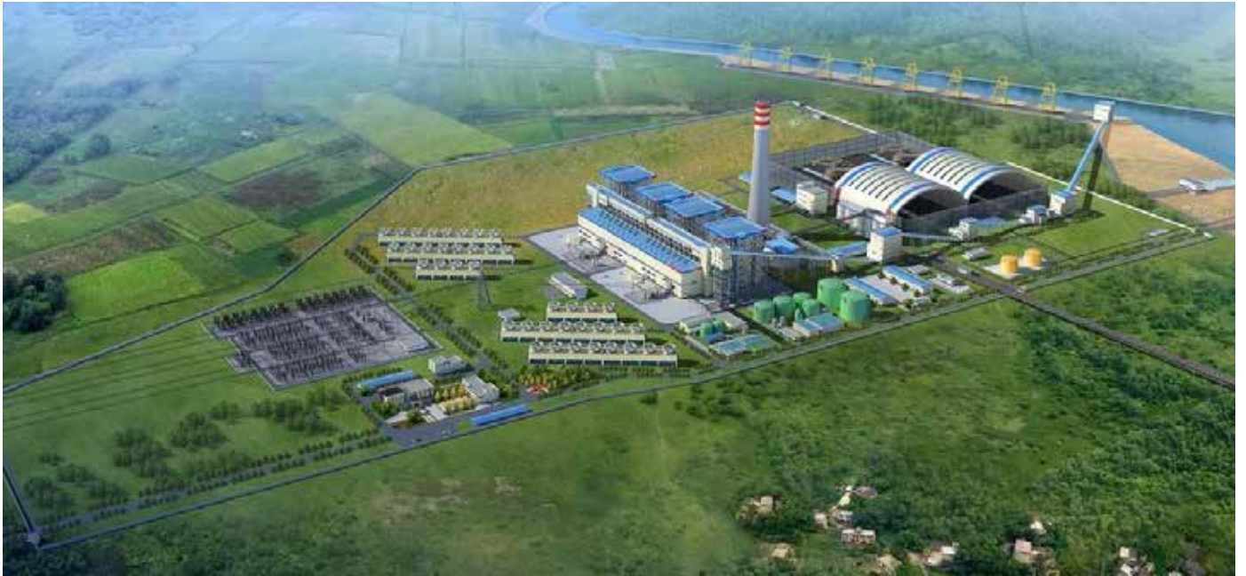
Figure 1: JAKS' Power Plant Perspective View